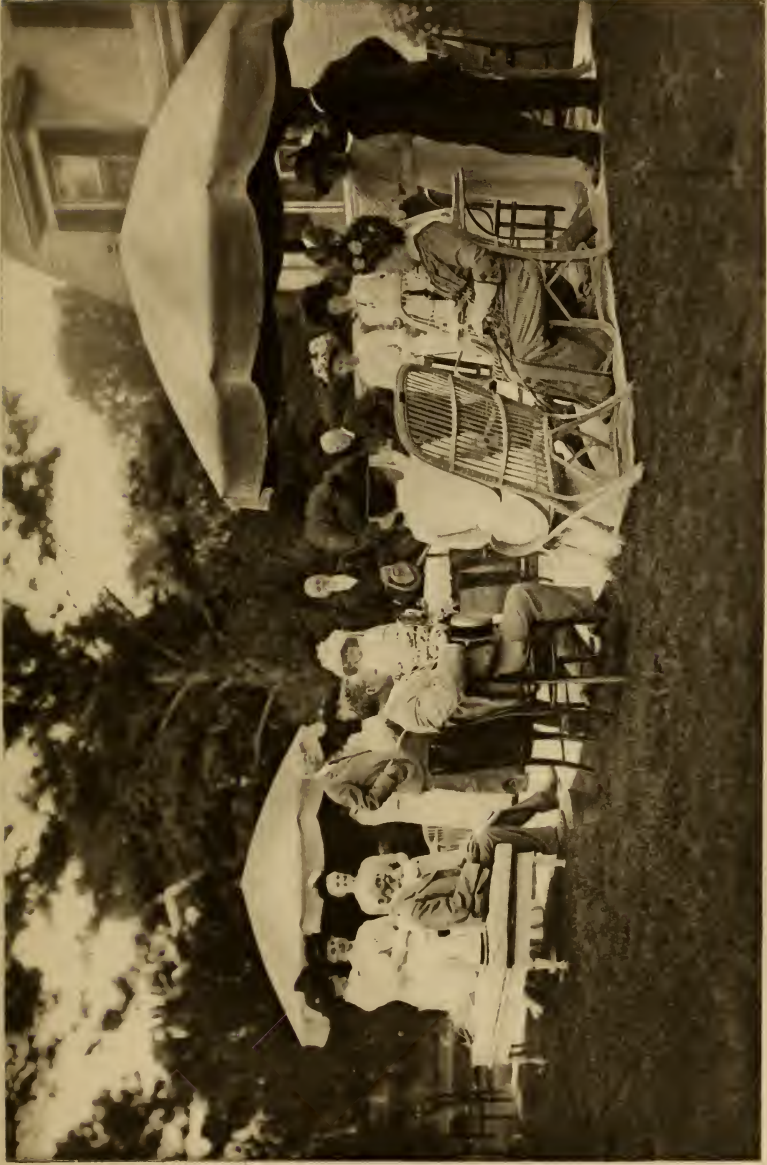
"LAWN PARTY" MISTLETOE COTTAGE